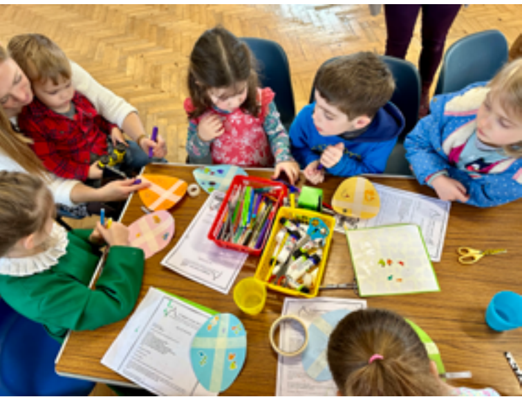
◀ Easter activities for children