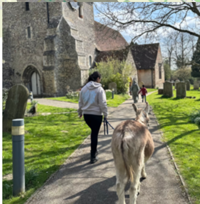
▲ Billy the Donkey leading our Palm Sunday Procession

St Stephen's Infant and Junior Schools are close by the church; they are parts of two different secular multi-academy trusts. Previous Rectors have been governors at both schools and conducted assemblies but links are weaker now—this is an area for development. The schools visit the church building and churchyard for curriculum purposes and there is scope for developing this.