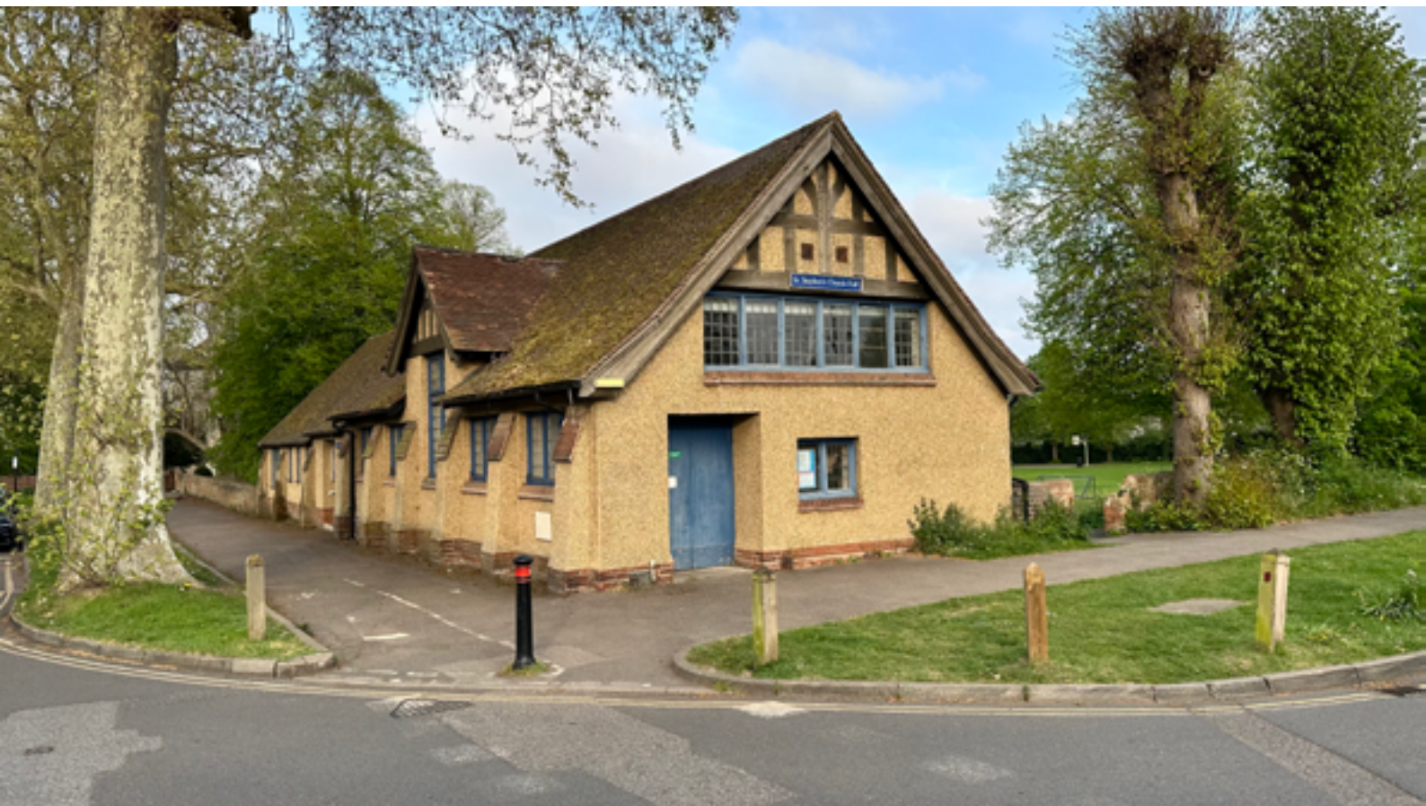
▲ St Stephen's Church Hall; the church is at the end of the path towards the left of this picture

The present church is about nine hundred years old with later developments. Work required by the last Quinquennial (2022) has been completed and the church has been made more accessible.